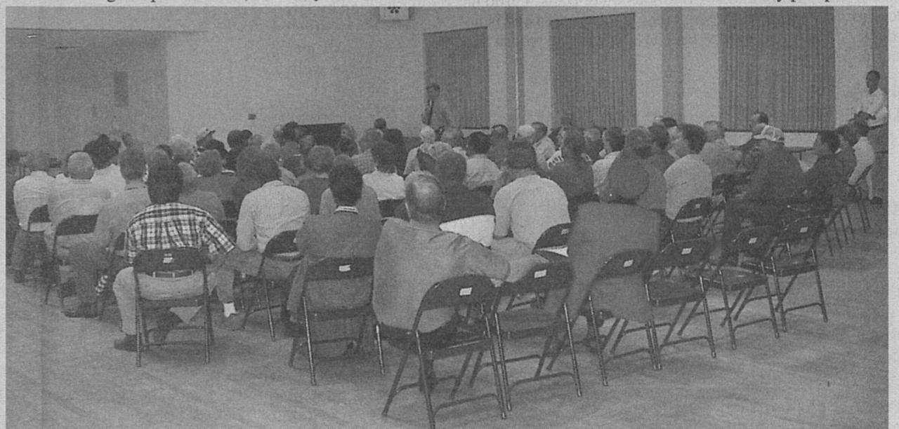
A large crowd gathered at the Eagle Lake Community Center Monday night to hear information on the formation of the Groundwater Conservation District, despite the weather.